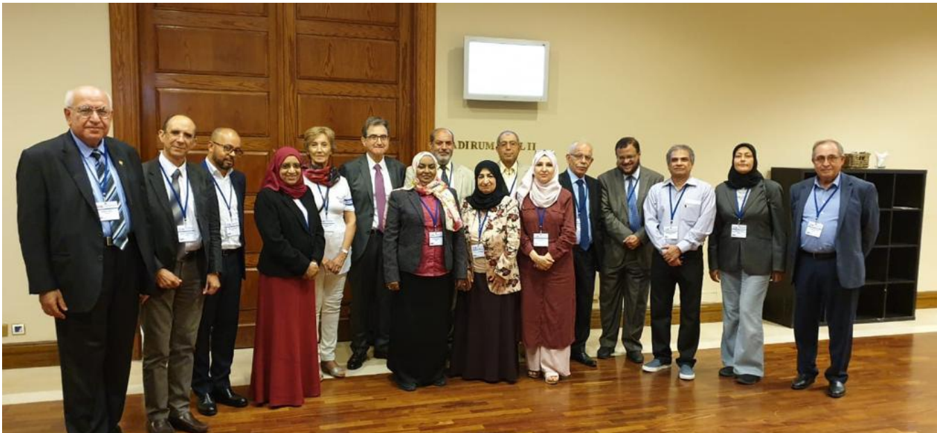
The Council Members of the ADIAP at the conclusion of the Council annual meeting.