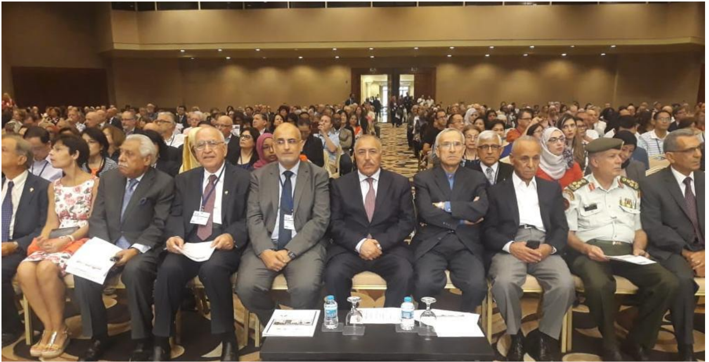
Upper; The opening ceremony of the 32 nd Congress of the International Academy of Pathology. Lower; The Organizing Committee members at the conclusion of the Congress with a "thumbs up."