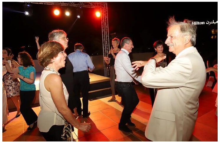
At the Gala Dinner which took place on the evening of Wednesday the 17 th of October, where traditional folklore dancers performed, accompanied by participants from the Congress. Many of the attendees joined and gathered around the dancers, trying to imitate their moves.