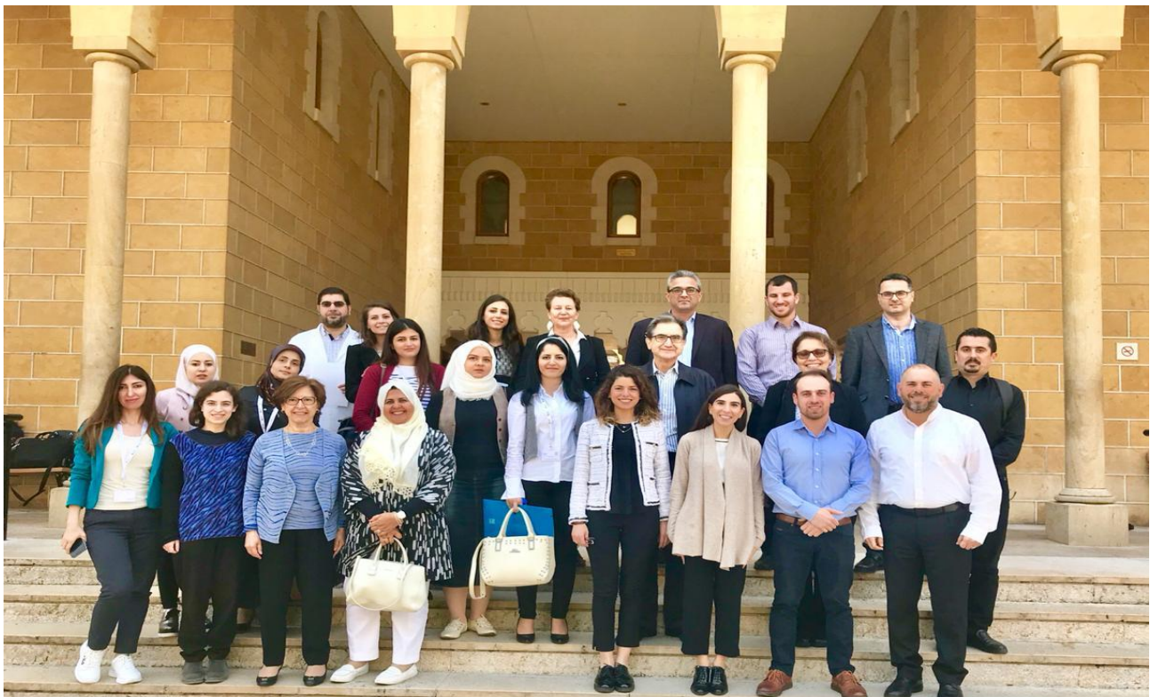
Speakers, organizers and delegates of the workshop in front of the Collage Hall at the AUB.

The educational programs of the Arab School of Pathology primarily target pathologists in training and junior/senior pathologists. Around 50 participants from multiple countries including the Gulf countries, Syria, Iraq, and Lebanon attended the activity.